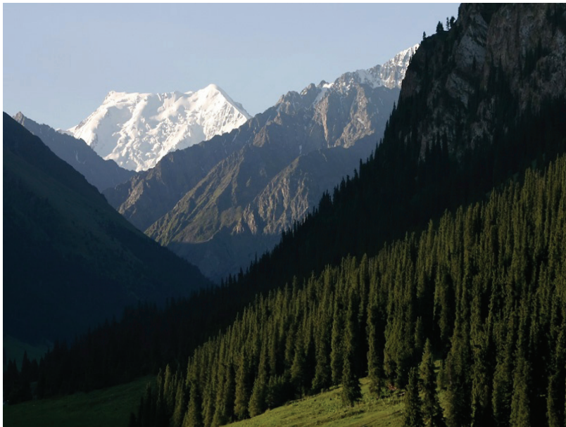
Spruce forest in Kyrgyzstan (Anonymous)