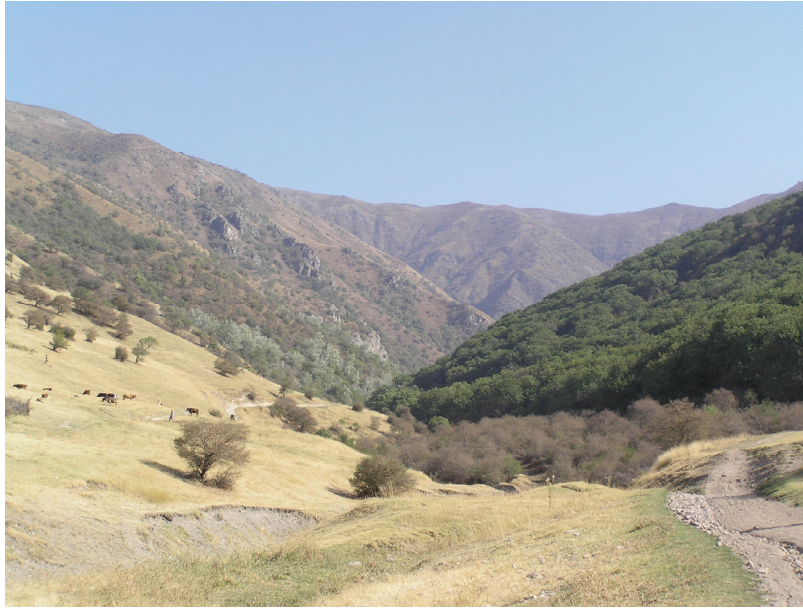
Forest and grazing in Kyrgyzstan