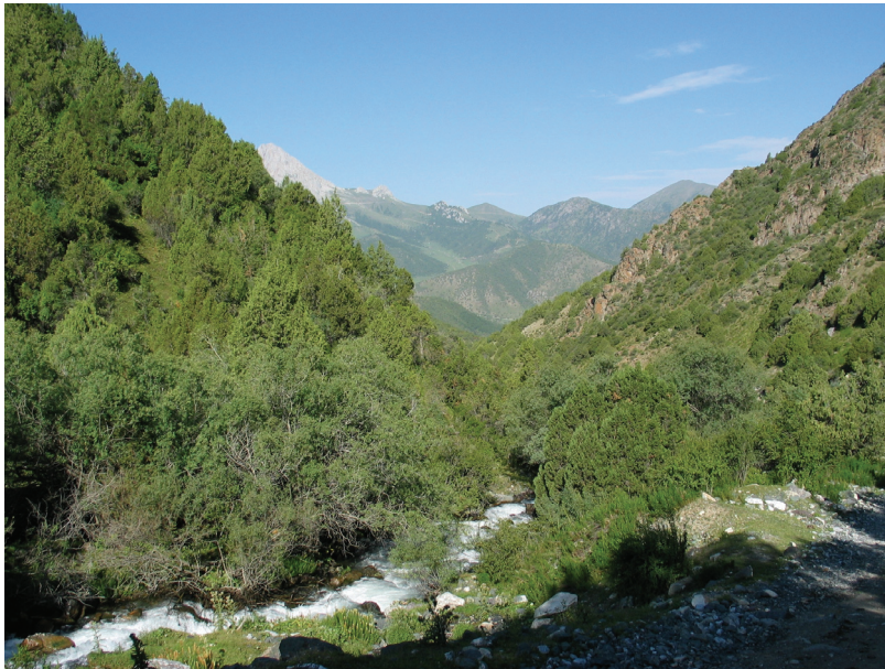
Juniper forest in Kyrgyzstan