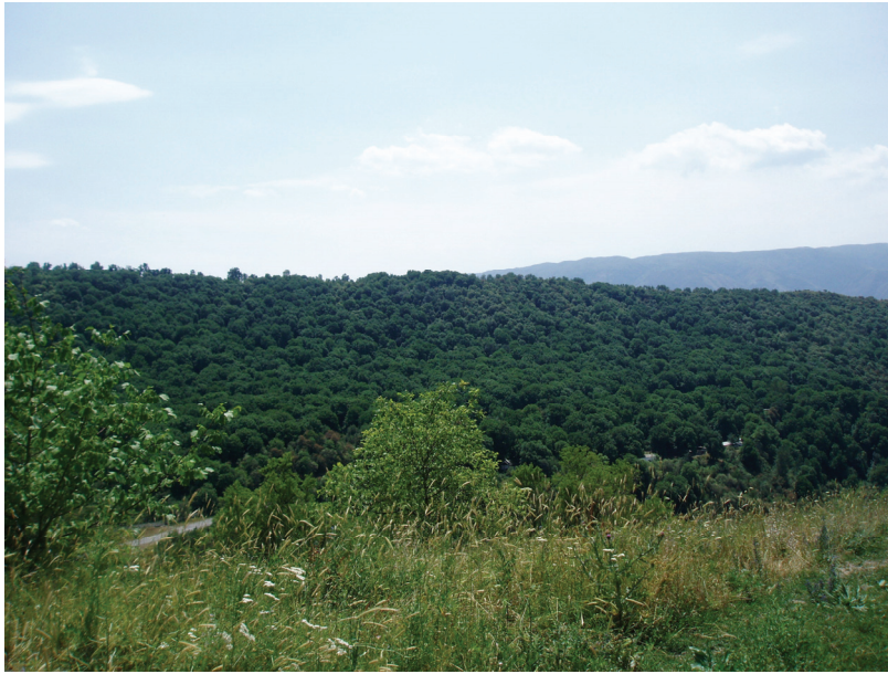
Walnut forest in Kyrgyzstan