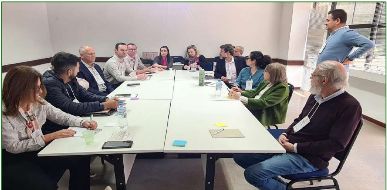
Break-out group discussion