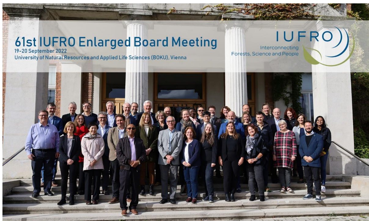
In-person participants of the IUFRO Enlarged Board Meeting in front of the Wilhelm Exner House of BOKU.