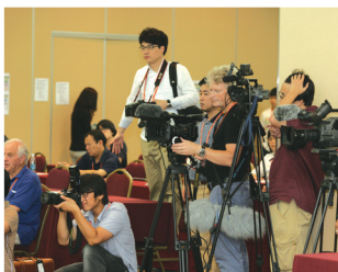
Each Plenary presenter held a press conference after their keynote speech.