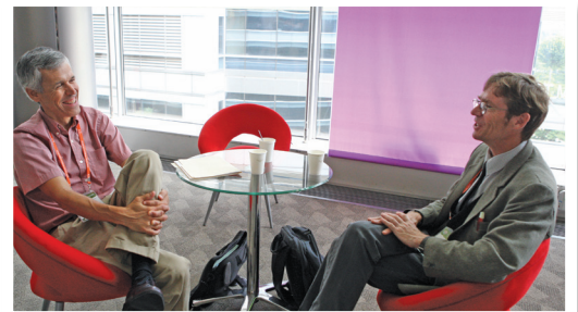
A meeting room was not always necessary when delegates talked shop; often, the tables and chairs arranged in the hallways sufficed.