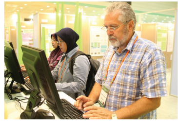
The venue's Internet lounges were rarely empty as delegates far from home logged onto the Web. Pictured above, a computer bank in the Poster Viewing area.