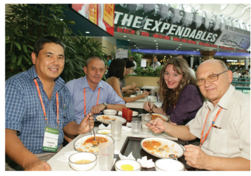
Four delegates lunch on bokumbap - Korean-style fried rice - at the COEX mall's food court. The COEX mall attached to the Congress venue contains more than 80 restaurants, giving delegates many kinds of cuisine to choose from.