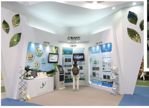
The creative shapes and designs of booths in the Trade Exhibition added to the show's appeal. Pictured above, the Korea Forest Research Institute's booth.