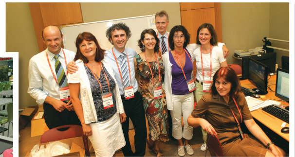
The Secretariat of the International Union of Forest Research Organizations. In addition to taking care of a myriad of administrative tasks, the team operated a popular exhibition booth in the main lobby.