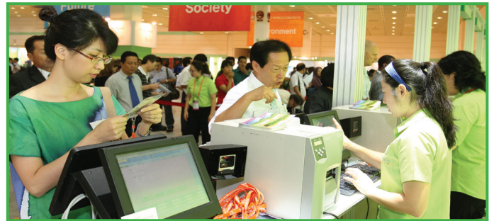
Student staffers working at the registration desk.

If it weren't for the 133 green-shirted Korean staffers and volunteers, the Seoul Congress wouldn't have been as smooth as beech tree bark.