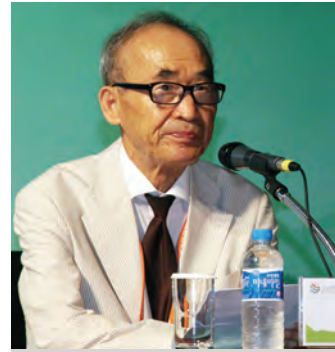
Ko Un, Korean poet

Throughout the week participants attended daily plenaries led by a range of experts, from Nobel laureates to renowned scientists and poets.