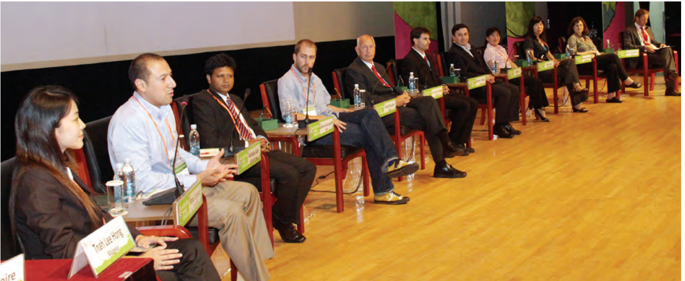
Winners of IUFRO's Student Award for Excellence in Forest Science and Outstanding Doctoral Research participated in a panel discussion on their motivations, challenges and experiences in conducting their research projects