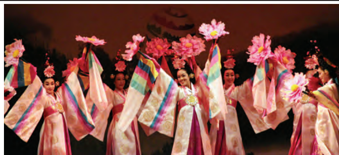
Performance of the traditional Korean dance called the "Lotus Flower"

During the closing ceremony, the 2010 Congress Resolution was distributed, which details focal areas for future work and institutional commitments for IUFRO as an organization. Finally, new members of IUFRO's decision-making body, the International Council, were approved and a new president-elect announced.