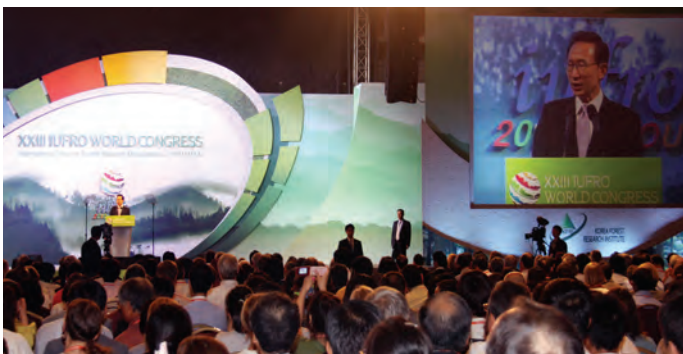
Lee Myung-bak, President of the Republic of Korea

Lee Myung-bak, President of the Republic of Korea, discussed his country's efforts to restore its once barren lands, noting that forests are the foundation of our lives and the source of our basic needs. He said the Republic of Korea now ranks fourth in the Organisation for Economic Co-operation and Development for its ratio of forests to total land area.