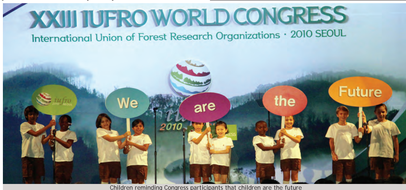
Children reminding Congress participants that children are the future