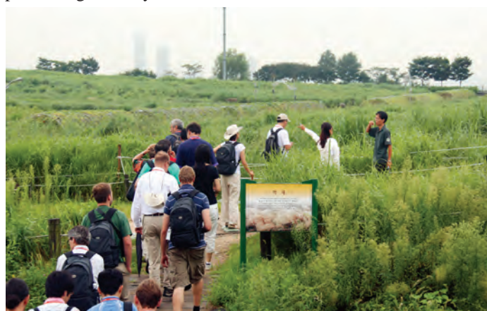
IUFRO participants in an excursion to the World Cup Park, a landfill site turned Eco-Park

On Thursday participants braved the rainy, foggy weather and headed into the field on eight trips organized to illustrate innovative forest-related projects around the Republic of Korea. Of the eight field trips, IISD RS covered two: Landscape Restoration and Sub-alpine Forest; and Old-aged Natural Forests and Landfill Restoration. The remaining field trips included excursions about: a protected area for biological diversity; non-timber forest products (NTFPs); conservation and utilization of forest genetic resources; forests and human health; SFM and the ecosystem approach; and the wood processing industry.