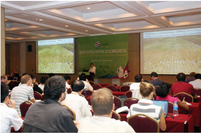
Participants heard presentations on linkages between biodiversity and climate change