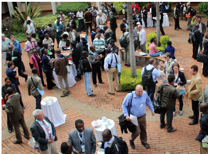
Participants networking during a break from the presentations.

He described the use of allometric equations to measure the amount of carbon in trees. MacFarlane then identified two competing issues of consistency and local accuracy, explaining that while general equations should be used to achieve consistency over large regions or nations, locally-derived estimates are more accurate, because trees of the same species do not have the same mass in different areas. He concluded that national consistency can be achieved through the use of generalized biomass equations.