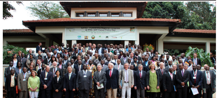
Group photo of participants at the First IUFRO-FORNESSA Regional Congress

IUFRO: Uniting scientists from around the world, IUFRO works to promote the coordination and implementation of international cooperative science on research related to forests and trees to advance the wellbeing of forests and the people who depend on them. The first IUFRO World Congress took place in 1893, with Congresses convening approximately every