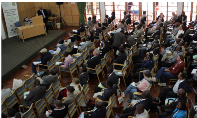
The audience during plenary

building materials to enhance goods and services. He identified the key issues of tenure, regulations and incentives, to generate renewable environments and economies.