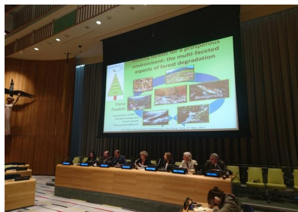
Side event of IUFRO TF on Climate Change and Forest Health