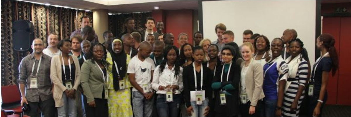
Students participating in the pre-side event workshop