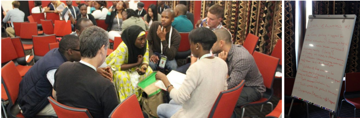
Group brainstorming

To analyse interactively and compare collectively the challenges of forestry education in Africa, the audience of students was divided into five groups, and the results of each group were presented to the general audience. Discussions for solutions were conducted following the same format. Finally, several questions were formulated, and meant to be addressed during the IUFRO-IFSA joint side event, which followed the workshop for restitution of the outcomes.