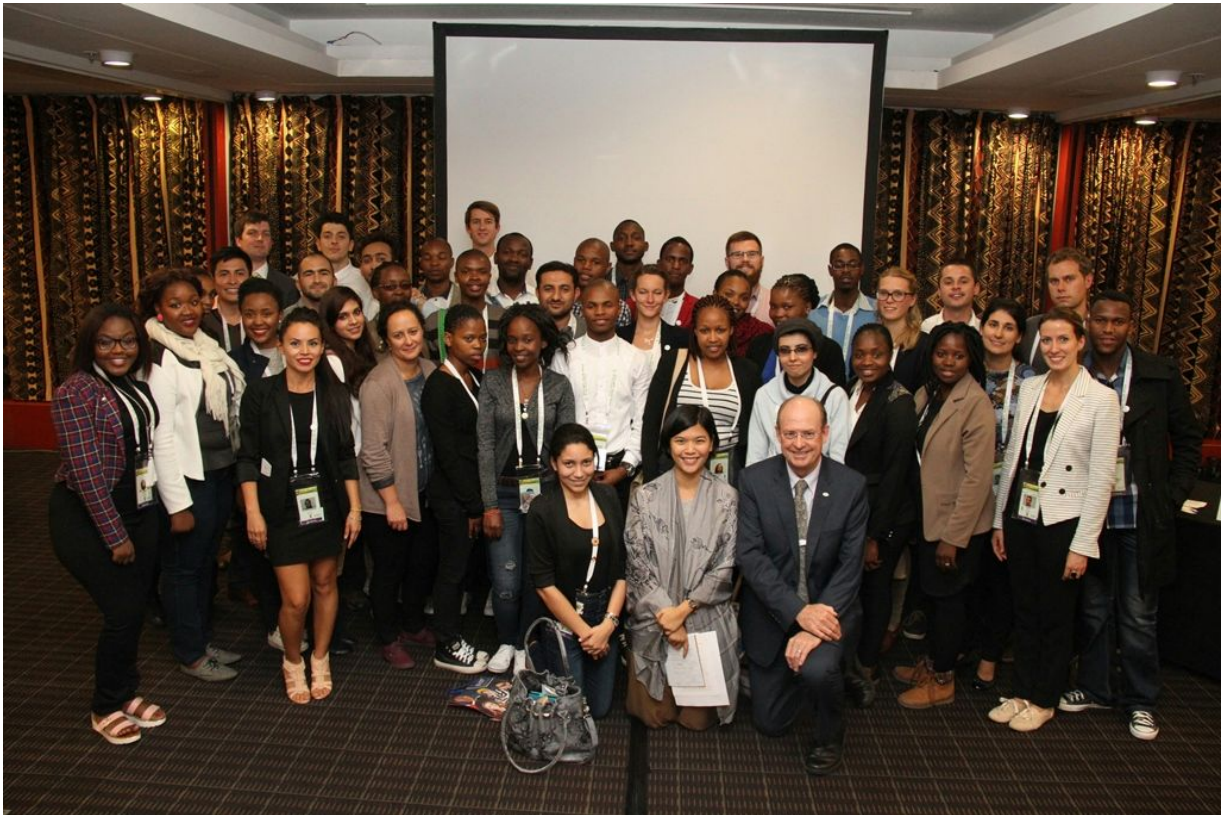
Group photo of some of the participants at the IFSA-IUFRO side event

The closing remarks were made by Prof. Wingfield , who drew the attention of students to the next IFSA Symposium, which will be held in South Africa in 2016 and encouraged them to be more proactive in their search of opportunities.