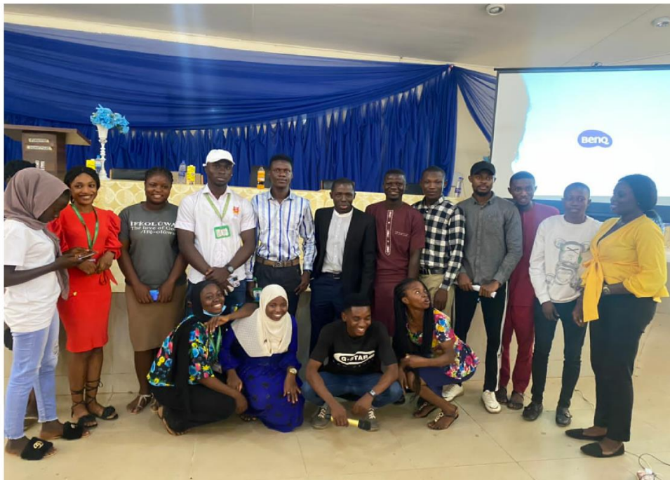
UFSA Executives and YAFP Local events Organizing committee 2020/2021.