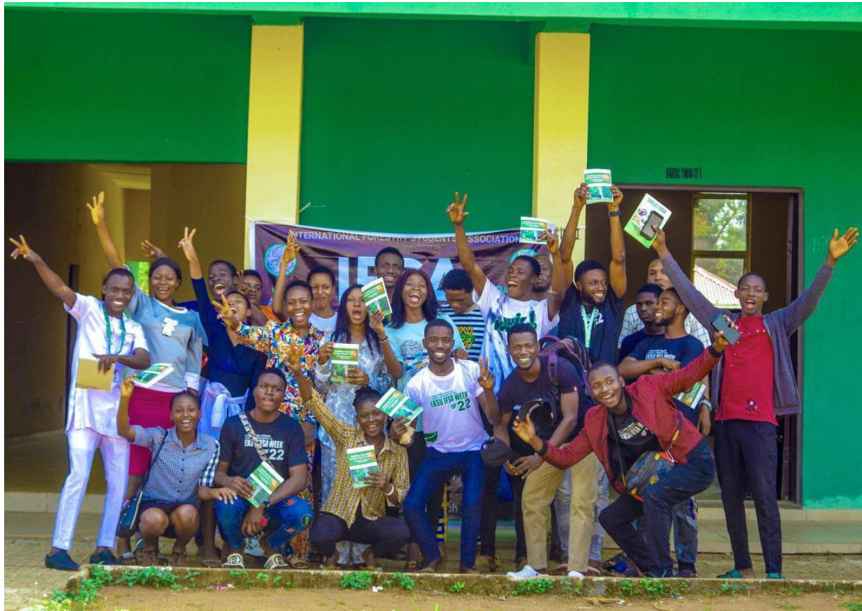
From YAFP Book Launch Events at Ekiti State University, Nigeria