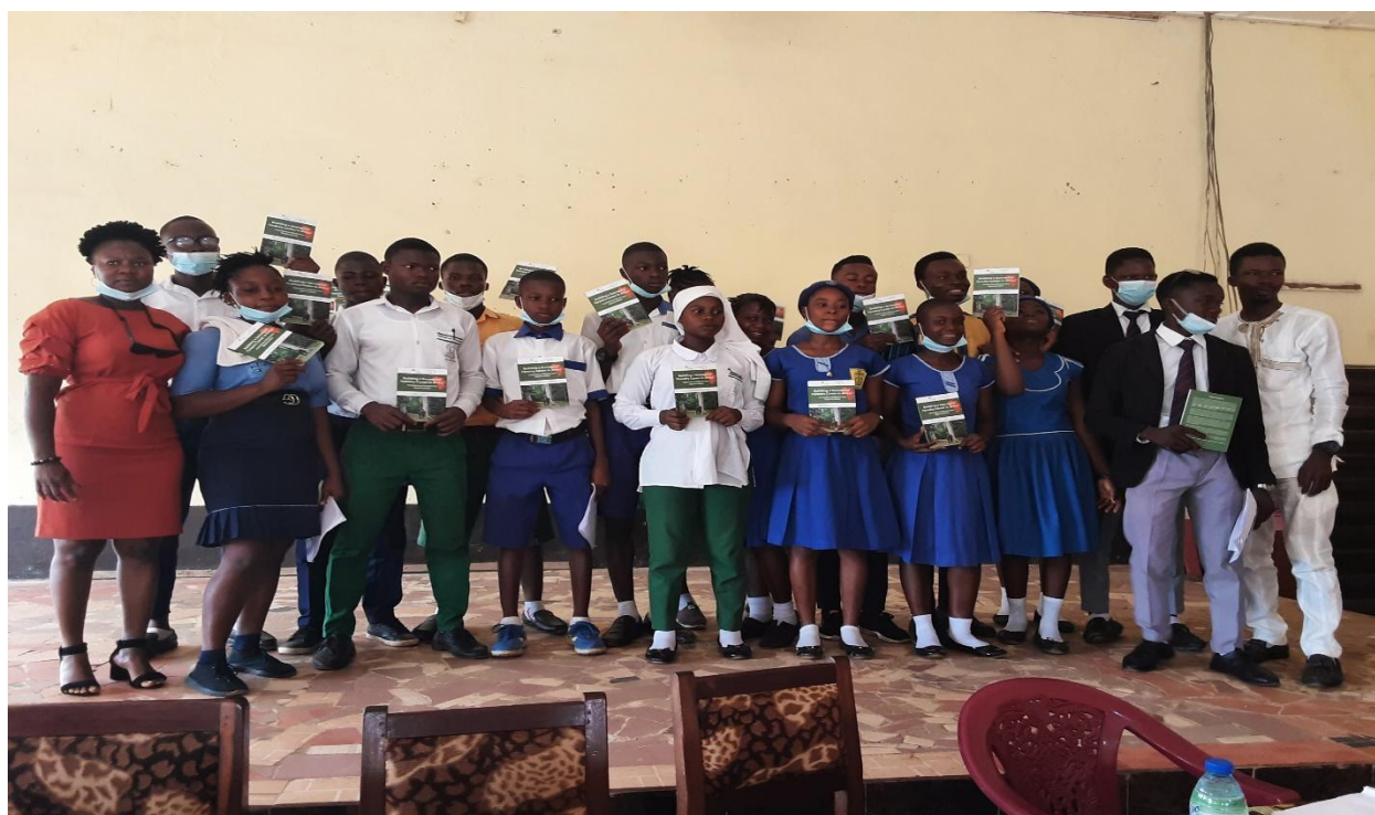
From YAFP Book Launch Event at Njala University, Sierra Leone