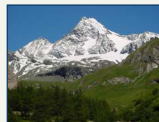
Großglockner, Austria, 3708 m

Peter Jordan Straße 82 1190 Vienna/Austria E-mail: mf@boku.ac.at www.boku.ac.at/mf.html