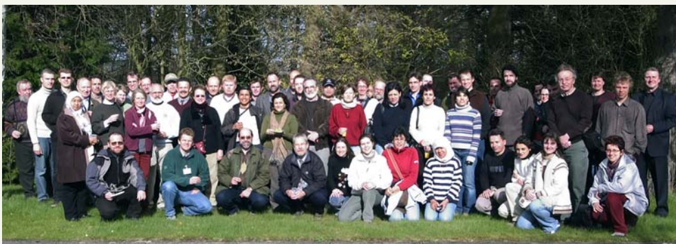
after the conference field trip when delegates visited the Forest Research, Northern Research Station in Roslin.