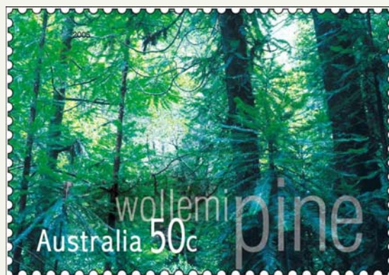
One out of 5 specially designed Congress stamps