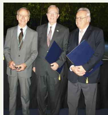
New IUFRO Honorary Members