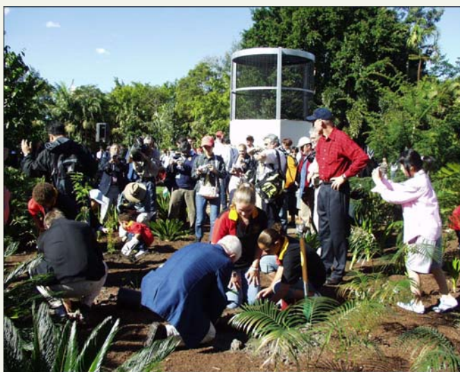
Tree planting ceremony at Brisbane Southbank Parklands

The XXII IUFRO World Congress "Forests in the Balance – Linking Tradition and Technology" provided a unique forum to present the results of the collective global research related to forests and trees.