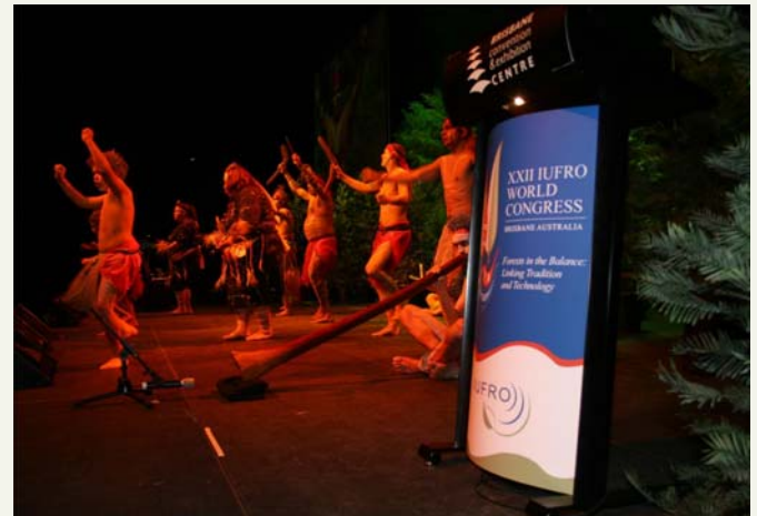
Yuggera Aboriginal Dance Troupe at the Opening Ceremony

The XXII IUFRO Congress has brought together some 2100 delegates from 90 countries, who enjoyed this excellent opportunity of presenting their research activities in about 700 oral and another 700 poster presentations. The Congress served as an ideal platform for the cross-disciplinary exchange of information and experience in forest-related sciences.