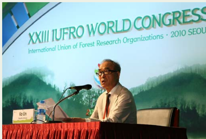
Keynote speaker Ko Un, Korean poet (top) and audience