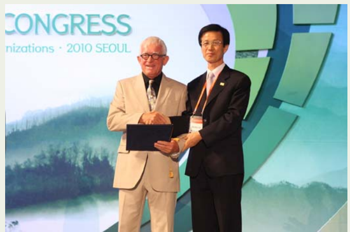
All photos in this section by courtesy of COC Korea (online Congress picture gallery)