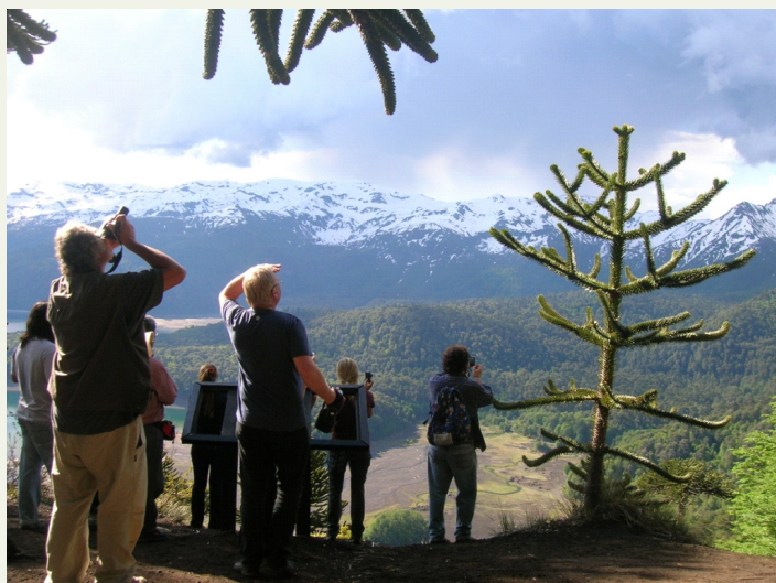
Post-conference field trip to Conguillio National Park in southern Chile

This year, for the first time, the Working Party gathered in the southern hemisphere, namely in Latin America. The region offers new challenges to forest landscape