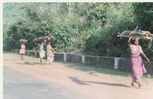
Non timber forests product collection

http://www.iufro.org/media/iufro-spotlights/