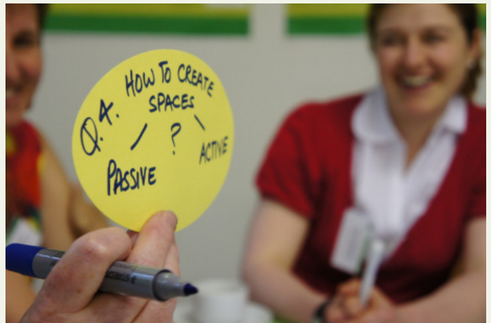
Photo 1: Leipzig floodplain forests. Photo Matilda Annerstedt. Photo 2: Group exercise. Photo Matilda Annerstedt.

on the roles of urban nature in adapting cities to climate change and promoting human health and wellbeing, among other things. Urban forestry, one of the delivery approaches in this respect, can build on almost fifty years of history in bringing woods and trees to urban people's doorsteps. Another important approach is that of green infrastructure, as it uses a 'language' that has attracted the attention of politicians, planners, and the private sectors. Examples of innovations in both urban forestry and green infrastructure delivery were presented in Leipzig, ranging from post-hurricane restoration of the Point Pleasant urban forest in Halifax to the establishment of native woodland on green roofs in Hong Kong.