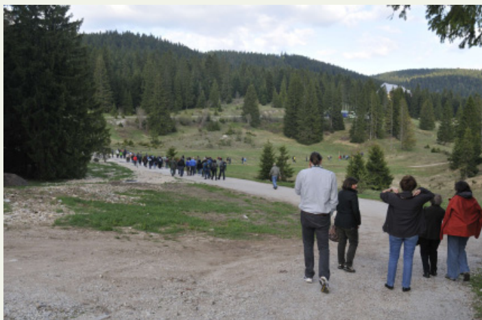
The youngest Division in IUFRO, Division 9 Forest Policy and Economics, is on its way; here to Igman mountain near Sarajevo during the all-Division 9 conference.

The first IUFRO all-Division 9 conference was held in Sarajevo from 8-11 May 2012. The conference was hosted by the Faculty of Forestry at the University of Sarajevo in Bosnia and Herzegovina and supported by the Forest Policy and Economics Education and Research (FOPER) project, the IUFRO Special Programme for Developing Countries (IUFRO-SPDC) and the USDA Forest Service.