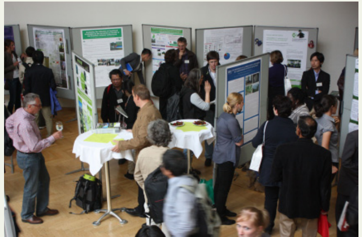
Poster presentation

The overall impression was that the conference offered a helpful platform to discuss global trends, examine the role of forests in a broader societal context and, define emerging key issues of strong interest to policy makers, society and groups inside and outside the forest sector. The conference certainly underlined the need for social science in forestry. It also showed the increasing relevance of interdisciplinary research to address various new societal needs such as research concerning matters of health and well-being, the development of new non-timber forest products and the improvement of livelihoods in developing countries.