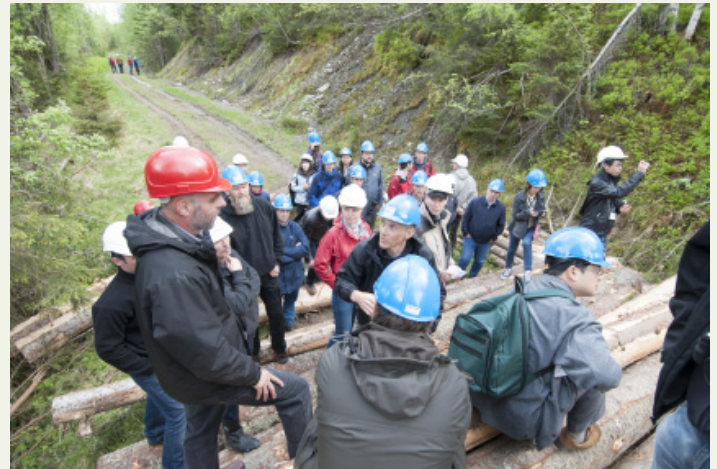
Interested onlookers watch the brand new Zöggeler excavator-based yarder /processor in action near Vingrom, Norway.

Sustainable interventions in mountainous forest areas represent a key issue and demand a deep understanding of the relationship between products, management practices and site susceptibility. Forest operations in mountainous terrain need to apply production systems which are adapted to specific local