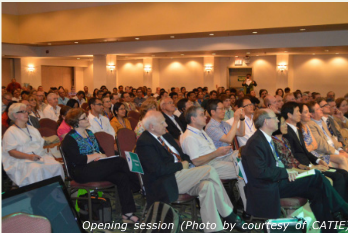
Opening session

With almost 600 participants, 4 keynote addresses, some 300 scientific papers presented in 53 technical sessions and 182 poster presentations, IUFROLAT III exceeded all expectations and outnumbered previous regional IUFRO Congresses by far.