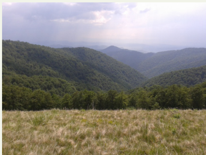
A view of the primeval beech forest of Uholka (Carpathian Biosphere Reserve) from the treeline (Photo by Alfredo Di Filippo).

A basis of shared indicators could be a starting point to test new indices for beech forest conservation value, an important contribution to the ongoing process of