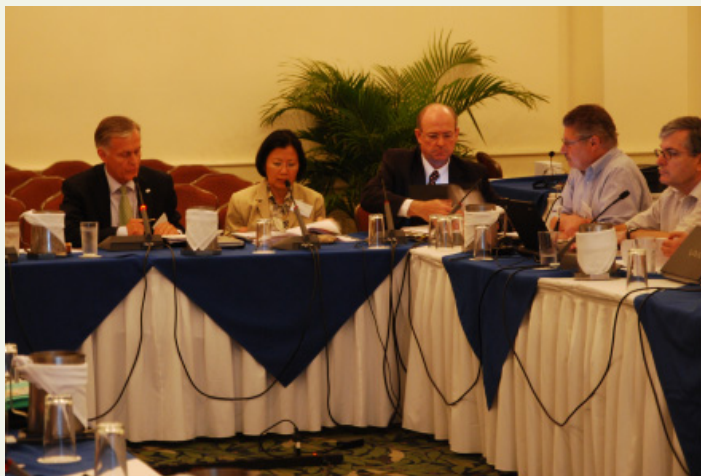
IUFRO Board Meeting