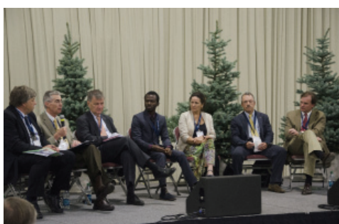
President's Discussion

Translations into French, German and Spanish are available at: http://www.iufro.org/news/article/2014/10/11/the-salt-lake-city-declaration/