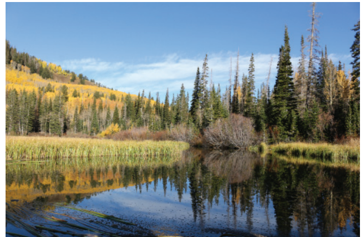
Photo from the in-Congress tour to Big Cottonwood Canyon in the Wasatch Range near Salt Lake City