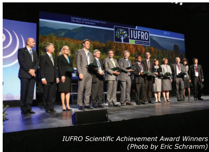
IUFRO Scientific Achievement Award Winners