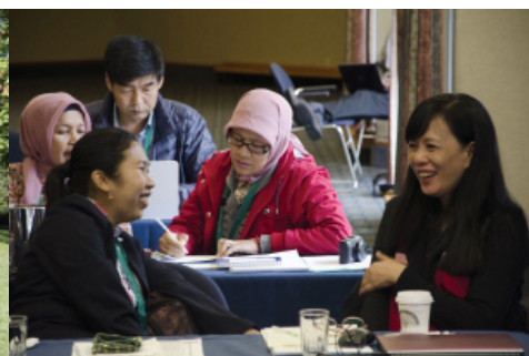
Participants of pre-Congress training course