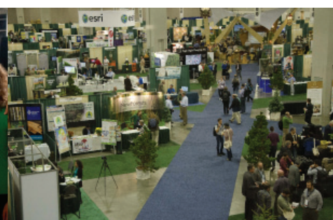
Exposition Hall