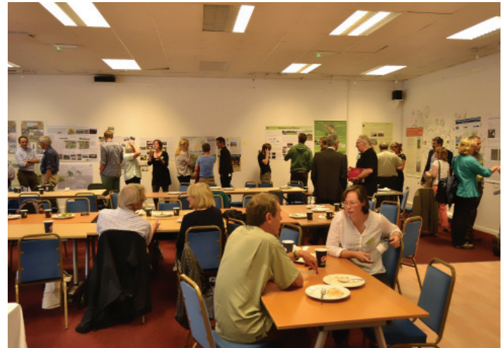
Discussion at the poster presentation session on 4th September.

often under-valued and sometimes un-recognized and affected by Governmental economic and social policies that do not fully take into account their contribution to a range of ecosystem services.