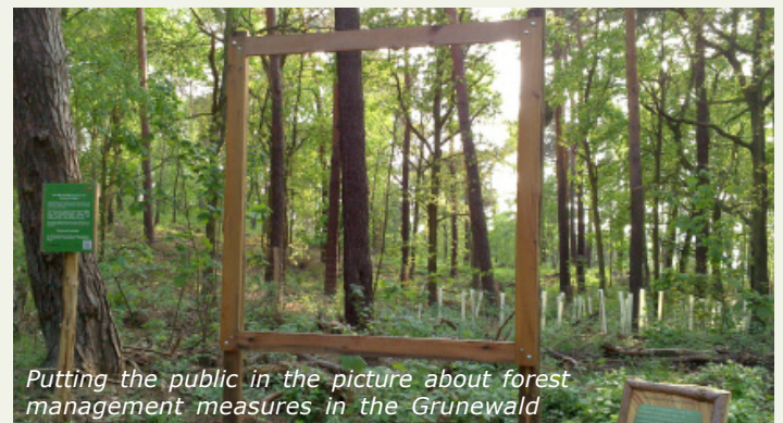
Putting the public in the picture about forest management measures in the Grunewald

Also read: http://www.unece.org/index.php?id=35464