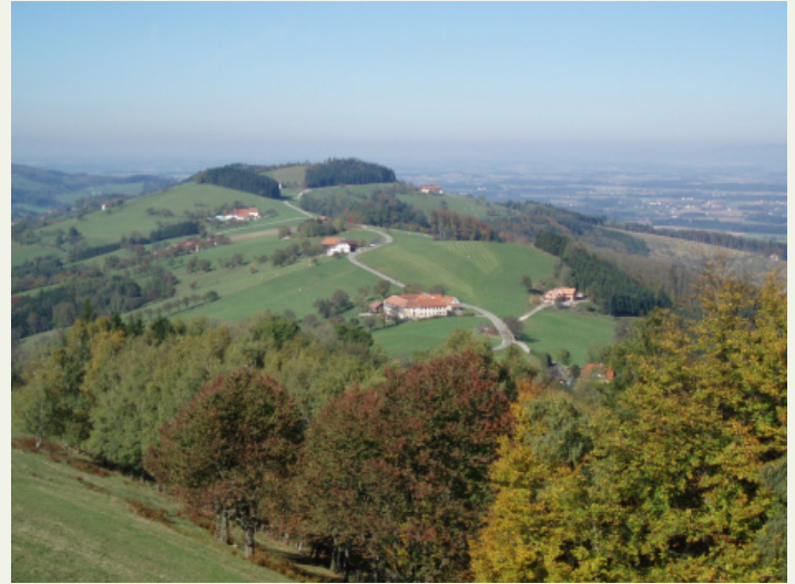
Rural landscape in Austria

The relationship between biological and cultural diversity or biocultural diversity and the rural territory is considered as one of the most important perspectives for the implementation of the Joint Program of Work. The scientific and policy dimensions of JP-BiCuD are of utmost importance in the European context where cultural, environmental and rural policies are devoted to the conservation of biodiversity and cultural heritage, but rarely focused on the features and the effects of the interactions between nature and culture. Yet, throughout European history, the outcomes of such interactions, including through traditional farming and forestry practices, have been critical for creating resilient landscape patterns, diversifying biological and cultural resources and shaping the cultural identity of different European subregions.