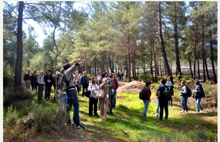
Discussion on a pine processionary spot during the field visit

Population genetics can be a powerful tool, as was clearly demonstrated through several presentations on the pine processionary moth (PPM) complex species and its parasitoids, as well as on Platypus cylindrus and the Turkish oak gall wasps. The power of this tool can be significantly increased at the landscape level. Several presentations looked at insect biodiversity in various ecosystems, especially oak and cedar forests. The possibility of using this faunal diversity as an indicator of ecosystem richness was discussed.