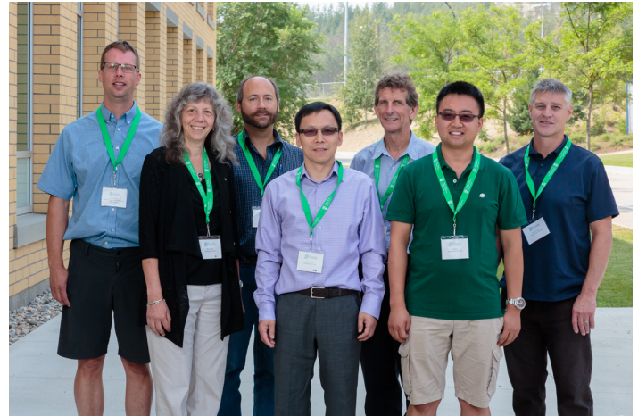
Organizing Committee