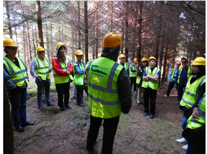
Thinning spruce/field tour

Extension and knowledge exchange does not exist only in the world of natural resource management: extension has a responsibility to help individuals and communities adapt to changing environmental conditions. This is the challenge facing Ireland and it provided the foundation for this conference.