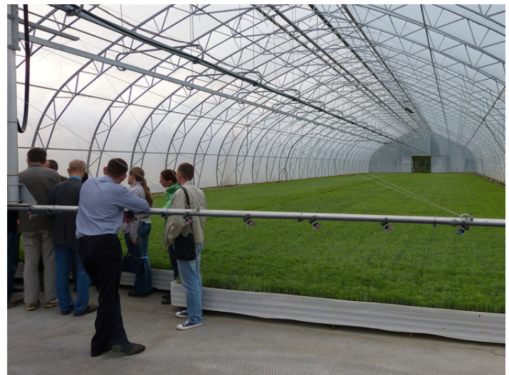
Trip to the regional Altai Forest Seed Breeding Center "Altailes"

Significant research studies and results were presented in the plenary and session talks and by means of posters. These findings are very important for the conservation of forest genetic resources in Siberia in particular, and of bo-