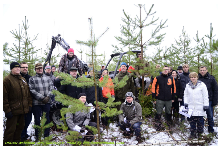
Workshop participants in a mechanically operated young pine stand.

Ongoing research projects in forest regeneration, drainage and management of young stands in the Baltic countries were also presented. An overview of the management of Latvia's state forests was followed by a state-of-the-art review of the ongoing research activities in mechanization of silviculture in Latvia. In addition, the work productivity of wood ash forest fertilization was addressed. Further