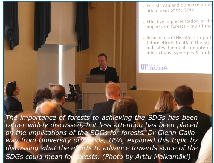
The importance of forests to achieving the SDGs has been rather widely discussed, but less attention has been placed on the implications of the SDGs for forests. Dr Glenn Galloway from University of Florida, USA, explored this topic by discussing what the efforts to advance towards some of the SDGs could mean for forests.

Based on the assumption that SDGs are implemented effectively and progress towards the different goals is attained, Dr Glenn Galloway (University of Florida, USA) explored the implications of some of the SDGs for both strict forest protection and for SFM. For example, Goal 1 (End poverty) could imply less emphasis on strict protection and more on SFM and development of forest-based activities to generate income and employment. However, efforts to create employment and income in other sectors could undermine SFM and increase pressure on forests. Goal 2 (End hunger) could favour forest protection and use rights to ensure sustainable access to food originating in forests, or land use change to convert productive land under forests into agricultural production. Goal 4 (Quality education) may lead to greater public concern for deforestation and loss of ecosystem services favouring public support