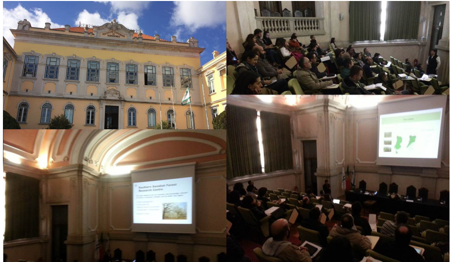
Participants at the seminar ‘Models and decision support tools for integrated forest policy development under global change’, Lisbon, Portugal, February 18.

The first part of the seminar focused on the characterization of the state-of-the-art in forest ecosystem management in SuFoRun partner institutions while the second part addressed specific ongoing research and potential synergies with the exchange program.