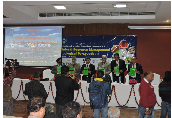
A special issue of the Indian Journal of Ecology with full papers presented in conference was released during the closing session.