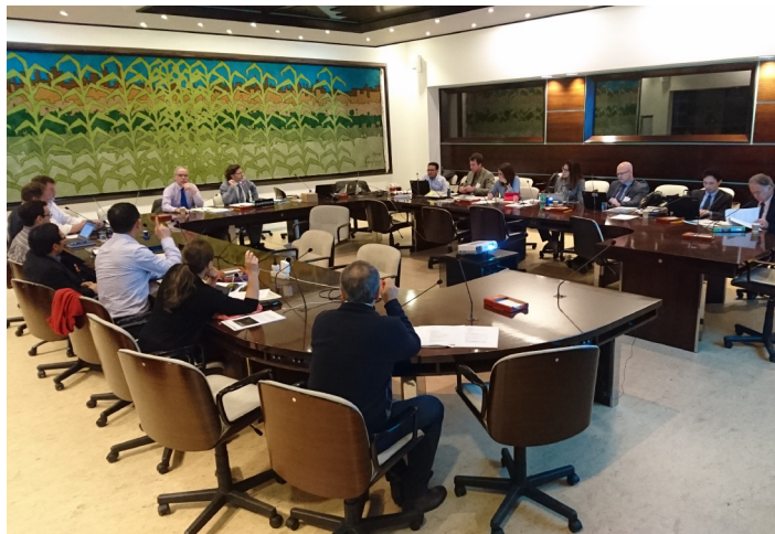
Scoping Meeting in March 2017

While numerous scientific publications and studies are available on “forests and water” the scientific information has not yet been systematically assessed and synthesized globally. Following the decision by the Collaborative Partnership on Forests (CPF), IUFRO has initiated a global scientific assessment on “forests and water” in the frame of the CPF's Global Forest Expert Panels (GFEP) initiative led and coordinated by IUFRO. The ultimate goal of the new assessment is to produce an up-to-date scientific synthesis report and associated policy brief on the topic by mid-2018.