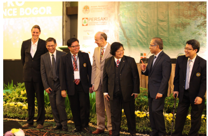
Panelists at the scientific conference on Forest-Related Policy and Governance: Analysis in the Environmental Social Sciences in Bogor, Indonesia.

The organizers are confident that this inspiring conference in a highly hospitable and appealing tropical atmosphere will also encourage other researchers, particularly IUFRO office-holders, to organize similar events for further stimulating vivid scientific cooperation on forests policy and governance around the globe.