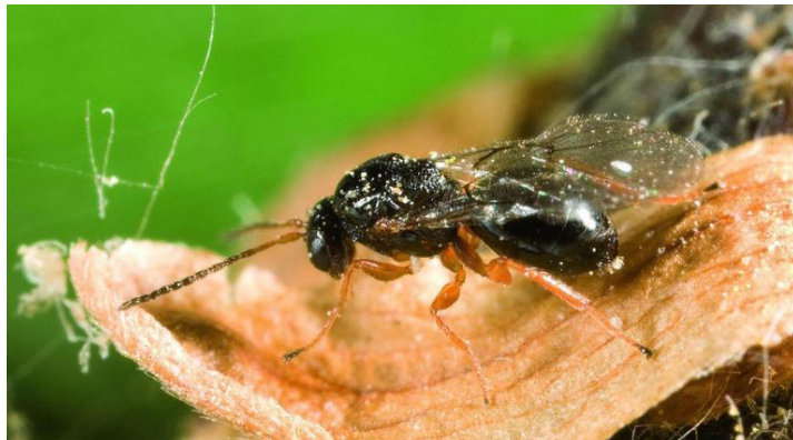
Dryocosmus kuriphilus (Oriental chestnut gall wasp)