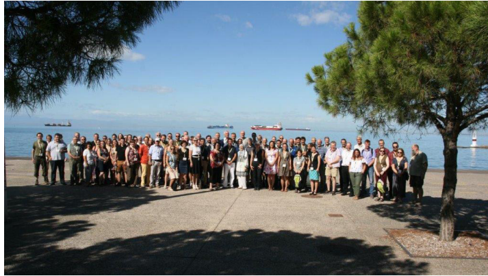
Meeting participants on the Promenade of Thessaloniki