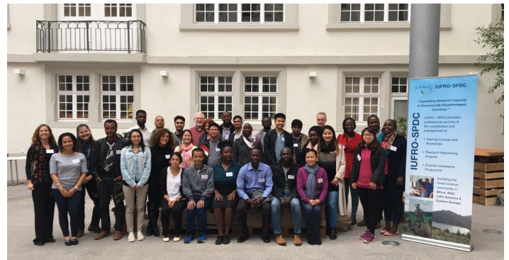
IUFRO-SPDC Pre-Congress Training Course at Freiburg University

Following the tree planting ceremony the History Exhibition "Interconnecting Forests, Science and People - IUFRO's activities of the past 125 years" was opened in the inner courtyard of the Herderbau. The exhibition was the creative and inspiring result of a unique cooperation between forest scientists from Freiburg University and art students from the University for Art, Design and Popular Music in Freiburg. A big thank you goes once again to all the organizers and students for an extraordinary show!