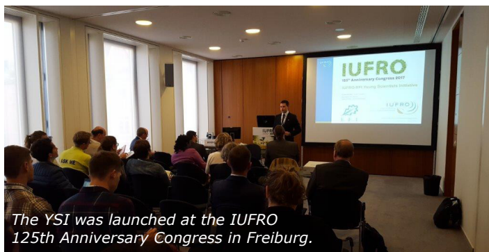
The YSI was launched at the IUFRO 125th Anniversary Congress in Freiburg.