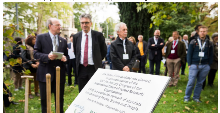
Tree planting (above), History Exhibition