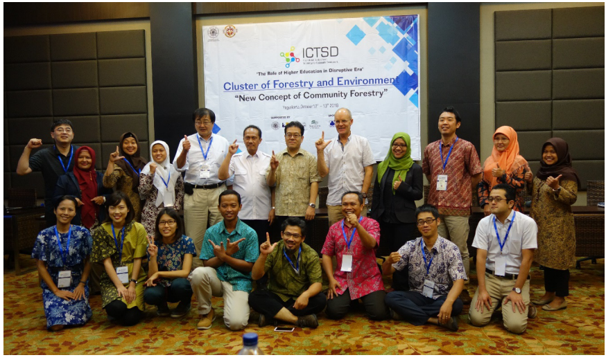
Participants of Forestry and Environment Cluster ICTSD 2018

Against this background, the Vocational College Universitas Gadjah Mada together with Semarang Merchant Marine Polytechnic (PIP), Nagoya University, University of Sunshine Coast Australia, and other stakeholders, and in collaboration with IUFRO, conducted the first International Conference on Technology for Sustainable Development (ICTSD) 2018 in Yogyakarta-Indonesia on 12-13 October 2018, focusing on "The Role of Higher Education in Disruptive Era". The ICTSD 2018 consisted of four clusters: Forestry