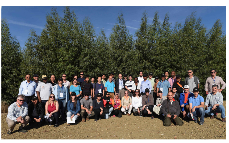
Participants of the post-conference tour in front of a 19-month-old coppice close to Castelnaudary (France) on 21 September 2018.

Meeting website: <a href="https://eucalyptus2018.cirad.fr/">https://eucalyptus2018.cirad.fr/</a>