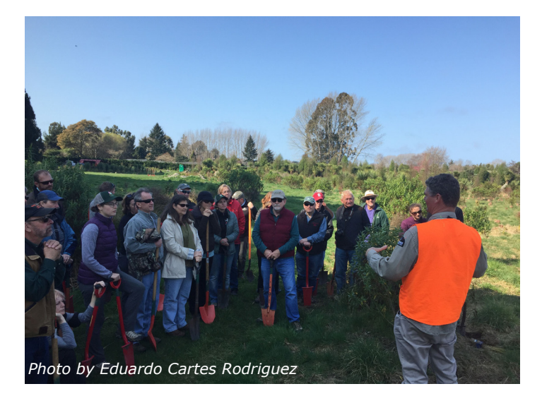
Vol. 47, Double Issue 10/11, 2018, page 2

Technology is playing an increasingly important role in the dissemination of education. The use of the internet, on-line trainings, videos, podcasts, and webinars have become important tools for extensionists across the globe. The acceptance of these tools is variable. How to increase social acceptance and acquire the social license to use these tools effectively is the challenge. The involvement of communities and stakeholders in the development of these tools and decisions remains key to success.