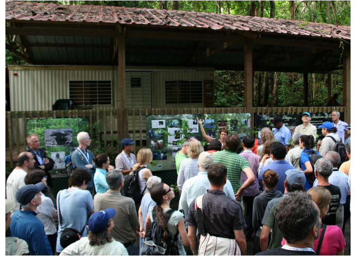
Conference "Synthesising and Sharing Globally Available Forest-related Scientific Knowledge" in Puerto Rico, 2017 https://www.iufro.org/science/special/spdc/netw/flr/flrconf/

For example, training young scientists in workshops coordinated by the International Union of Forest Research Organizations builds capacity that helps developing countries sustain and restore their forests. (...)