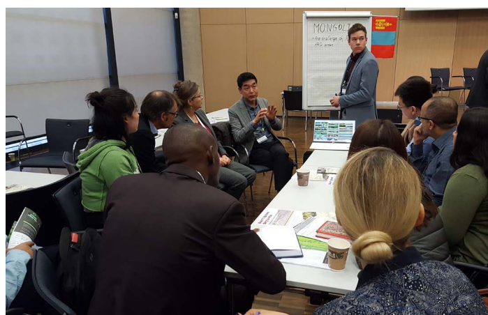
Discussion forum - moderated dialogue