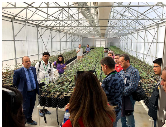
Discussion on oak production at the Denizli Forest Nursery, Denizli, Turkey 2018

Meeting website: http://www.iufroturkey2018.org/ IUFRO WP webpage: https://www.iufro.org/science/divisions/division-7/70000/70300/70304/activities/