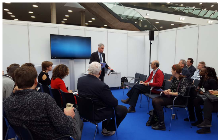
Learning Pavilion workshop

More information about IUFRO at the GLF and a link to the Practitioner's Guide and other publications: https://www.iufro.org/events/other-major-events/glf-2018/ Visit the GLF website: https://events.globallandscapesforum.org/bonn-2018/