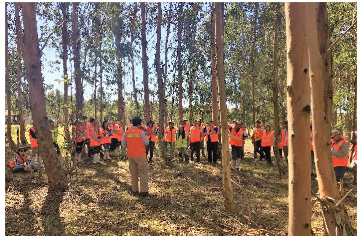
Field trip

The Working Party is also planning to prepare two publications, one on forest health issues in Southern Hemisphere plantations and the other on the economic impacts of pests and diseases in Southern Hemisphere commercial