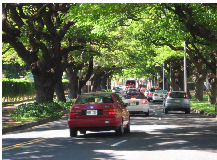
Design of trees along streets is important to minimize trapping of pollutants along sidewalks and roads.

Read the Spotlight here: https://www.iufro.org/publications/iufro-spotlights/article/2018/03/21/iufro-spotlight-58-to-build-a-healthier-city-build-a-better-forest/