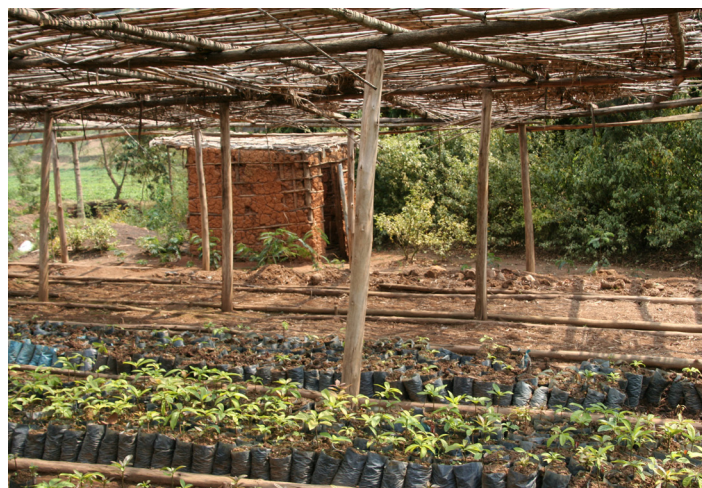
Growing seedlings for reforestation, Ruanda.