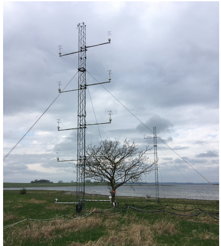
Oak tree at Risø campus, Roskilde, which is monitored for movement in the wind. Masts are instrumented with sonic anemometers to measure the flow in front of and behind the tree.