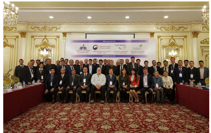
Workshop participants, organizers, speakers.