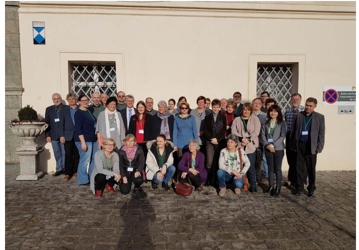
Participants in front of the conference venue Monastery St. Georgen am Längsee, Austria.

One of the main conclusions of the meeting is that to maintain and safeguard the cultural heritage of European forests it is necessary to incorporate the knowledge about cultural heritage into today's forest management plans. The integration of this knowledge into tourism concepts can provide valuable assistance here.