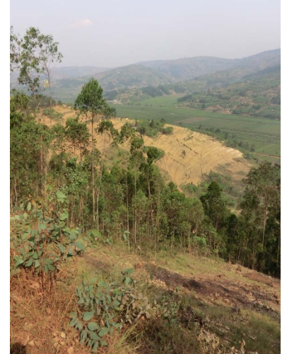
Restoration of sloping agriculture land in Rwanda.

https://www.iufro.org/science/special/spdc/netw/flr/