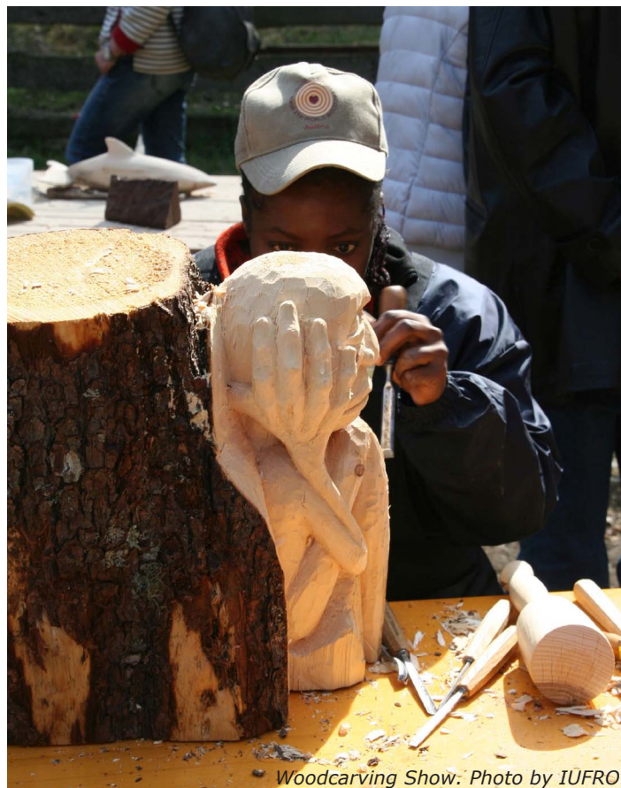
Woodcarving Show.

According to the overall motto “CHANGE”, the well-attended symposium (about 80 registered participants from almost 30 countries) looked into changes of techniques and technologies of wood use from tradition to innovation. Thus, archeological discoveries of wooden musical instruments were presented along with innovative macroscopic and microscopic methods of wood identification and the use of “smart wood for smart buildings”.