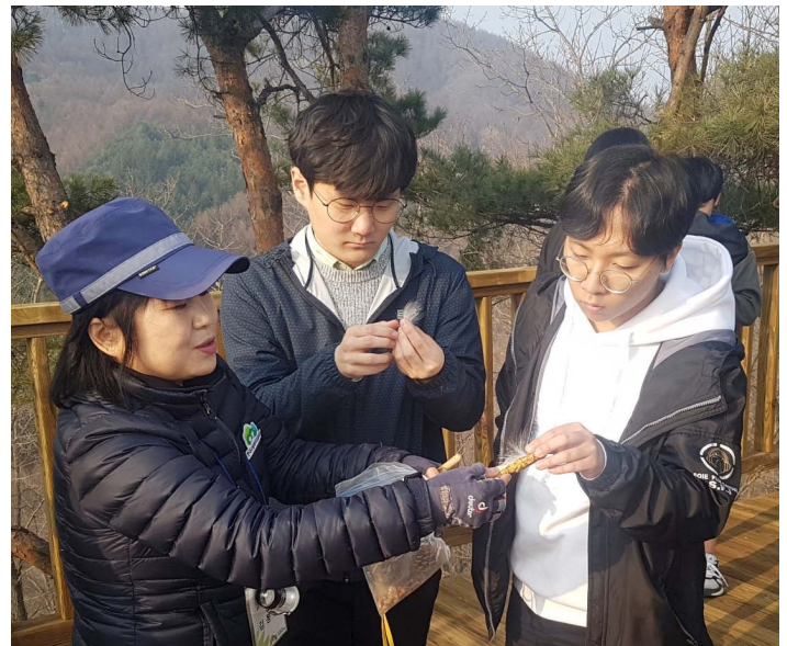
Practical sessions in the forests: learning through seeing. FOREST 101 program from the Republic of Korea

The competition brought together teams from 23 countries and a total of 71 proposals containing photos, videos and short descriptions. The categories eligible for the competition included primary, secondary and tertiary education. Predefined criteria including pedagogical quality, novelty of the practice and practical effectiveness were used to determine finalists. There was a lot of creativity as some groups went out of their way and submitted exceptional proposals showcasing international collaborations amongst institutions and individuals. Teams from nine countries and four continents made it to the top ten list.