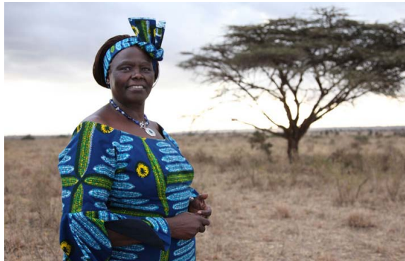
Professor Wangari Maathai.

The awardee will receive a cash prize of USD 20,000 along with international recognition of the outstanding contribu-