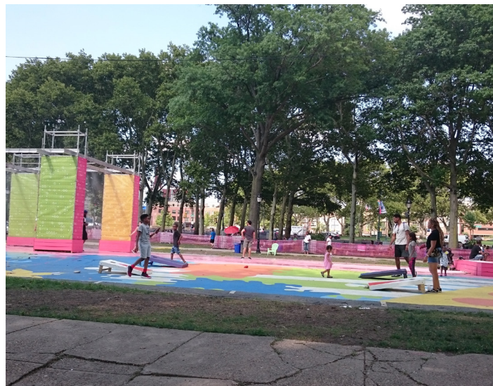
Benjamin Franklin Parkway, Philadelphia, Pennsylvania, USA.

Cities across the world are undertaking ambitious projects to expand tree canopy by increasing the number of trees planted throughout public and private spaces. In epidemiological studies, greenspaces in urban environments have been associated with physical and mental health benefits for city dwellers. Greenworks Philadelphia is a plan to increase tree cover across Philadelphia (PA, USA) by the year 2025.