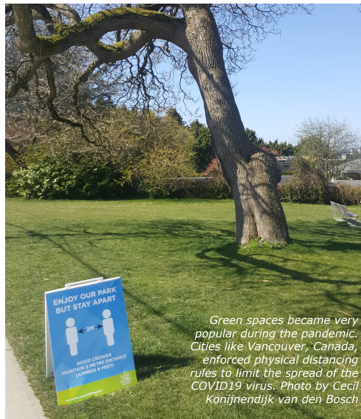
Green spaces became very popular during the pandemic. Cities like Vancouver, Canada, enforced physical distancing rules to limit the spread of the COVID19 virus.

But the authors ask 17 core questions under three main headings – Design; Perceptions, Use and Behaviour; and Inequities and Exclusions – that they feel are key to the future of our cities and public spaces and must be thoroughly examined as we move forward.