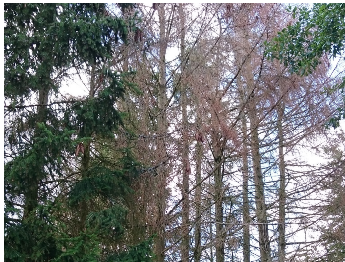
Spruce_ North Rhine-Westphalia_Germany_bark beetles_2019_Wolfrum.jpg

Find out more about this initiative of the IUFRO Task Force on Tree Mortality: https://www.tree-mortality.net/