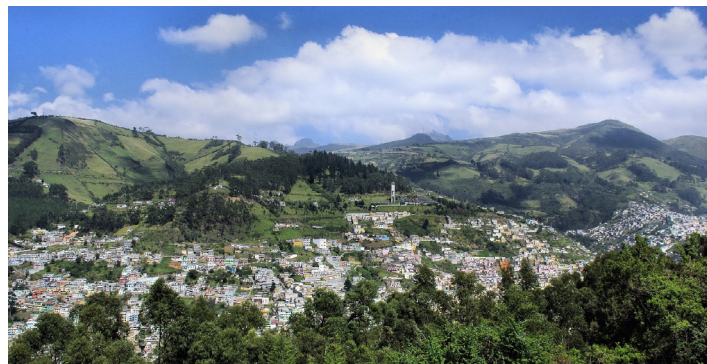
Quito, the capital of Ecuador, is among the first Tree Cities of the World.

The Arbor Day Foundation has long aimed to build greener communities around the world through recognition programs like Tree City USA and Tree Campus USA. In 2019, with support from the United Nations Food & Agriculture Organization (FAO), the first international recognition was launched: Tree Cities of the World .