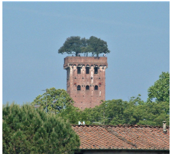
Torre del Guinigi, Lucca, Italy.