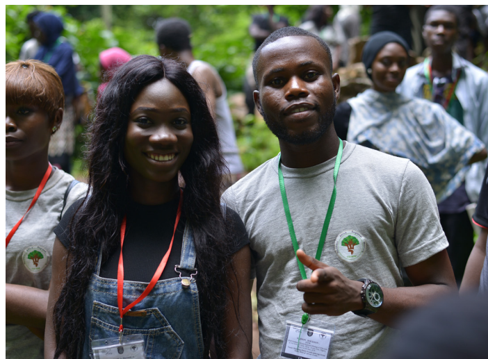
Students taking part in an excursion during the 2018 North African Regional Meeting of the International Forestry Students' Association.

To learn more about the project click here: https://ifsa.net/ifsa-iufro-africa-book-project/ All enquiries about the project should be directed to: jtfbookproject(at)ifsa.net