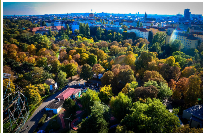
View of Vienna

21-23 Sep 2022 All-IUFRO Conference: Forests in a Volatile World – Global Collaboration to Sustain Forests and Their Societal Benefits Online and in-person, Vienna, Austria Submission of abstracts by 7 June 2022! https://www.iufro.org/events/all-iufro-conference-2022/