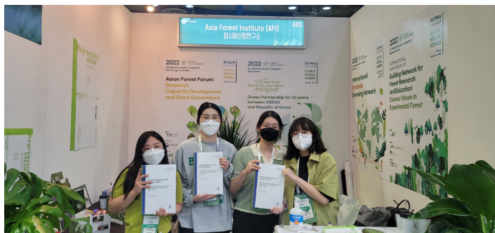
First copies

This book presents short biographical stories of forest scientists granted with three important awards of IUFRO.