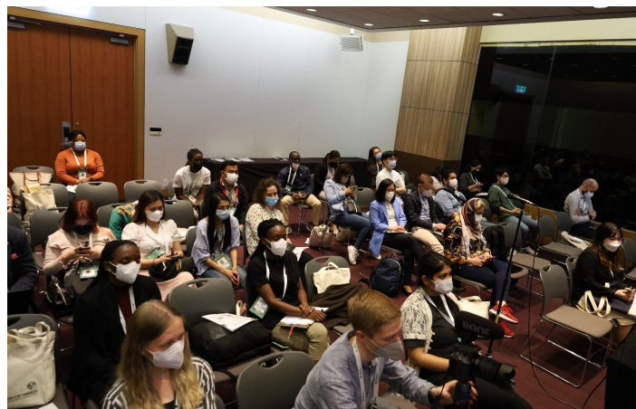
On-site participants of the “Forest Skills to Pay the Bills” side event at the XV World Forestry Congress.