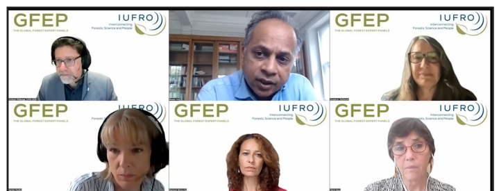
IUFRO organized and co-organized a series of outstanding hybrid side events.