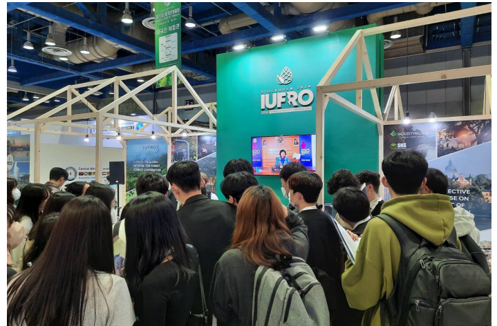
Joint booth of IUFRO World Congress 2024 and IUFRO, promoting the XXVI IUFRO World Congress in Stockholm, Sweden, 23-29 June 2024

The XV WFC attracted over 15,000 participants from 146 countries representing governments and public agencies, international organizations, the private sector, academic and research institutions, non-governmental organizations