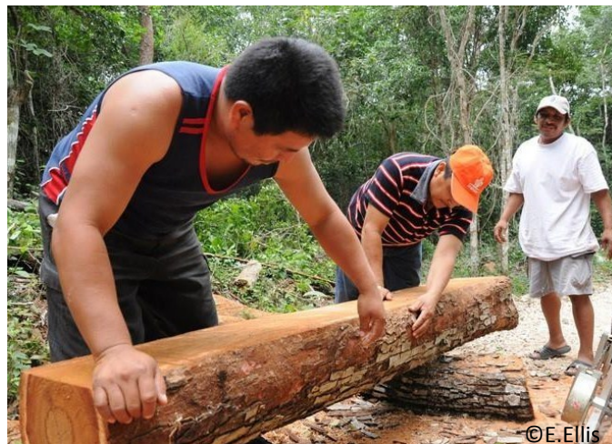
A log is processed to add value and facilitate transportation by members of a community forest enterprise in Quintana Roo, Mexico.