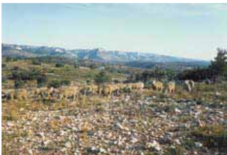
Prescribed burning under Aleppo pine stand in Luberon Natural Park

Prescribed burning was first introduced in 1992 as a technique for completing fuel management to decrease wildfire hazards. As more experience has been gained, the objectives have broadened including landscape management and wildlife habitat improvement