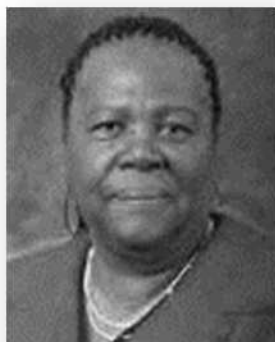
Dr Naledi Pandor National Minister: Science & Technology Carmen.h@dst.gov.za

Naledi Pandor is South Africa's Minister of Science and Technology. A life of exile from 1961 until 1984 resulted in an international flavour to her education. She holds a BA from the University of Botswana and Swaziland and an MA in Education from the University of London. In 1992 she studied for a Diploma in Higher Education, Administration and Leadership at Bryn Mawr in the USA. In 1997 she completed an MA in Linguistics at the University of Stellenbosch and a Diploma in Leadership in Development at the Kennedy School of Government at Harvard, while she was serving as an MP. She became an MP in 1994 and has amassed impressive experience in positions of public office, including deputy chief whip of the ANC in the National Assembly from 1995 to 1998, deputy chairperson of the National Council of Provinces in 1998, and its Chairperson from 1999-2004. Her experience in education policy planning made her a welcome appointment as South Africa's Minister of Education from 2004-2009. She was appointed Minister of Science and Technology in May 2009, and Minister of Home Affairs in October 2012. She was again appointed as Minister of Science and Technology in May 2014 following the 5 th democratic elections in South Africa. The Cape Peninsula University of Technology and Stellenbosch University have awarded her honorary doctorates.