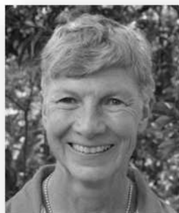
Prof. Mary Scholes

Sustainable forest management will ensure that the values derived from the forest meet present-day needs while at the same time ensuring their continued availability and contribution to long-term development needs. The newly declared sustainable development goals specifically includes forests: SDG 15 – Protect restore and promote sustainable use of terrestrial ecosystems, sustainably manage forests, combat desertification and halt and reverse land degradation and halt biodiversity loss. Biological challenges range from the protection of hydrological function to the maintenance of soil productivity and biodiversity. The paper will address the need for applying an integrated, soil, plant, atmosphere and social approach. Soil biological processes are key to achieving sustainable production. Advances in soil microbiological techniques as well as examples of integrated studies will be addressed.