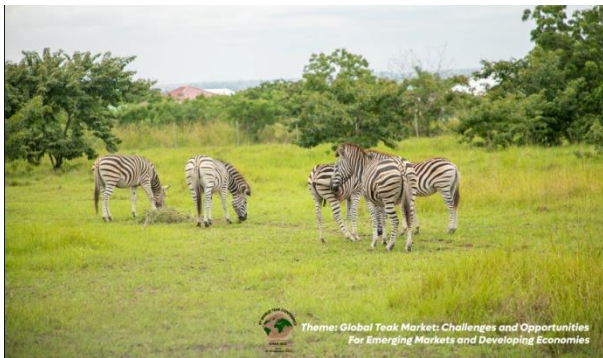
In Wildlife Reserve