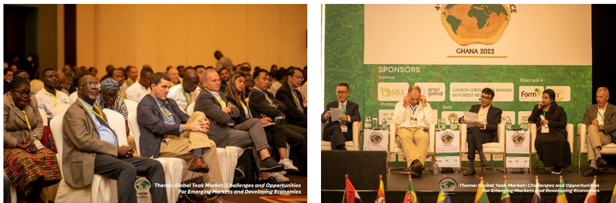
Interactive session in progress

of Posters were presented. There was one General Keynote at the beginning each session by prominent speakers followed by Oral presentations and three Panel discussions on important topics during the 3 days.