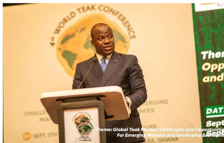
Mr. Samuel Abu Jinapor, Minister of Lands and Natural Resources at the Opening Ceremony

The Minister of Lands and Natural Resources, Mr. Samuel Abu Jinapor, MP speaking at the Opening Ceremony commended the organisers for selecting Ghana as a host for the conference at a time the world was recovering from the global COVID-19 pandemic. This, he said, would afford the governments and the private sector to work together to conserve natural resources and protect global ecosystems to support health and well-being platforms that gives opportunity to foster partnerships for the sustainable development and utilization of one of the most important tree species in the world.