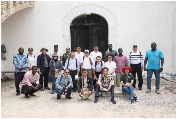
Delegates at Cape Coast castle