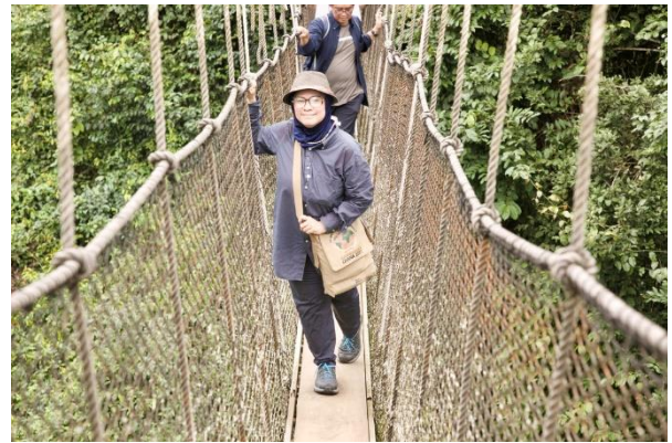
In Kakun National Park canopy walk