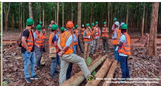
In FORM Ghana plantation at Kumasi