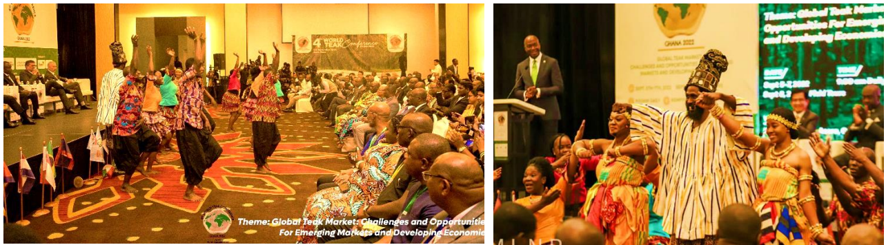
Traditional Ghanaian cultural interlude during the Opening Ceremony