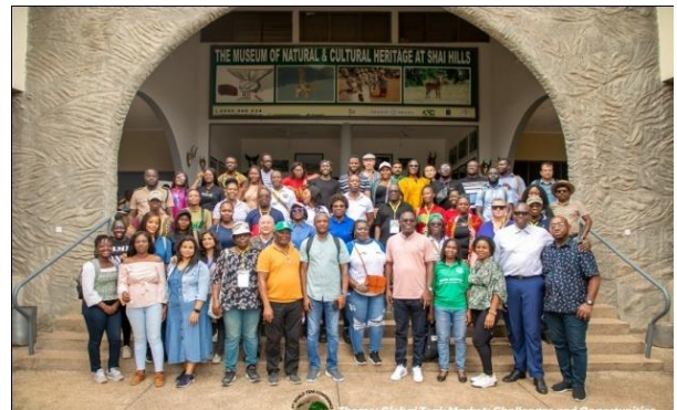
In Shai Hill Resource Reserve