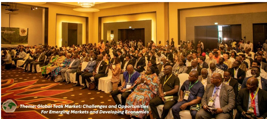
A view of the attendees during the opening session