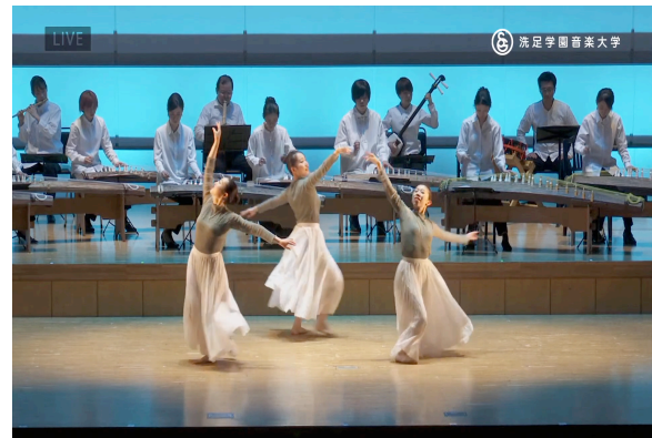
Live Stream Music Concert, Senzoku Gakuen College of Music, Tokyo, Japan.

scheduled for the weekend of the 21st of every month throughout the year. More details are available on the official website of World Wood Day 2021 ( http://www.worldwoodday.org/2021 ).