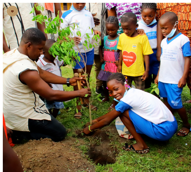
Tree Planting in Abidjan, Ivory Coast.