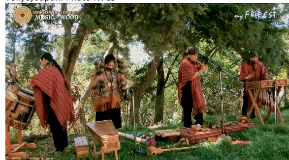
Live Stream Music Concert Themed "My Forest", Música Maya AJ in Chimaltenango, Guatemala.