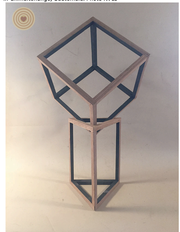
Collaborative Project "GeoTree".