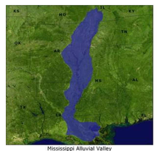
Figure 1. The Lower Mississippi Alluvial Valley stretches from Illinois to the Gulf of Mexico.

The Lower Mississippi Alluvial Valley (LMAV) covers more than 9.7 million hectares in parts of seven states extending from southern Illinois to the Gulf of Mexico (Figure 1). Historically, the LMAV was mostly riverine broadleaf forests (locally called bottomland hardwood forests). Alluvial floodplain forests exhibit high species richness and spatial diversity of vegetation communities (Kellison et al., 1998). More than 70 tree species are endemic to bottomland hardwood forests along with numerous vines, shrubs and herbaceous species (Putnam, Furnival,